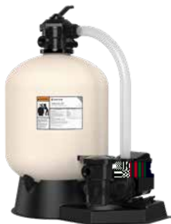
Sand Dollar Filter System 2

Our blow-molded process creates a one piece, non-corrosive tank of outstanding strength