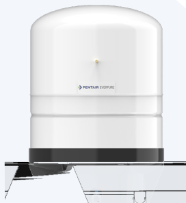
10-gallon hydropneumatic tank