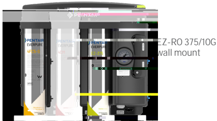
EZ-RO 375/10G wall mount